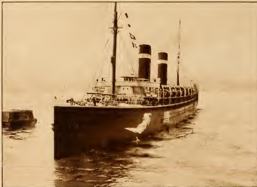
S. S. ST. LOUIS. This steamer has rendered valuable service during two wars.